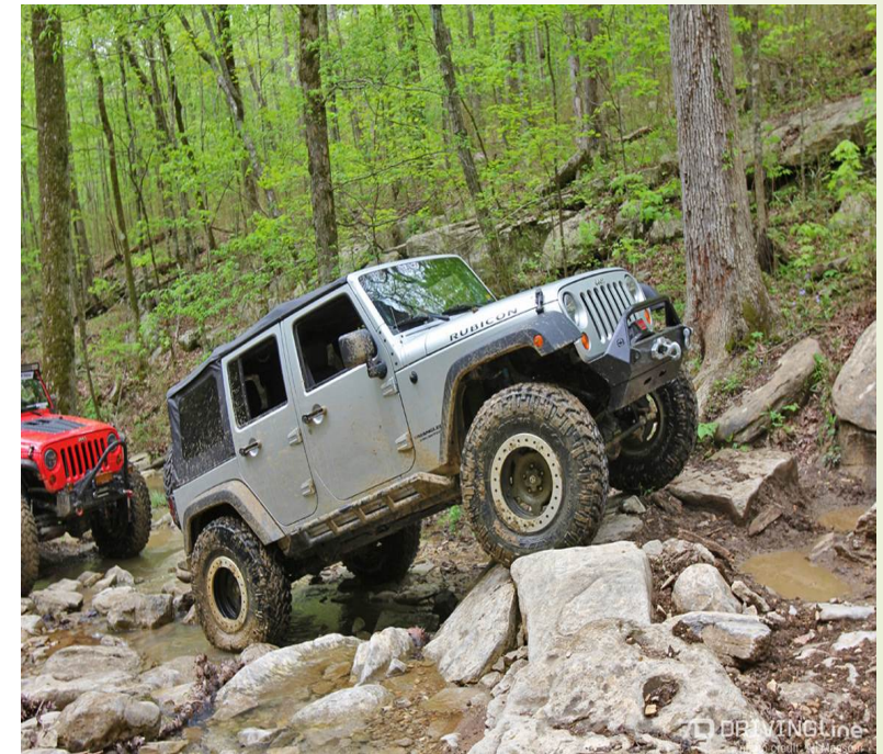
Operation Service Period